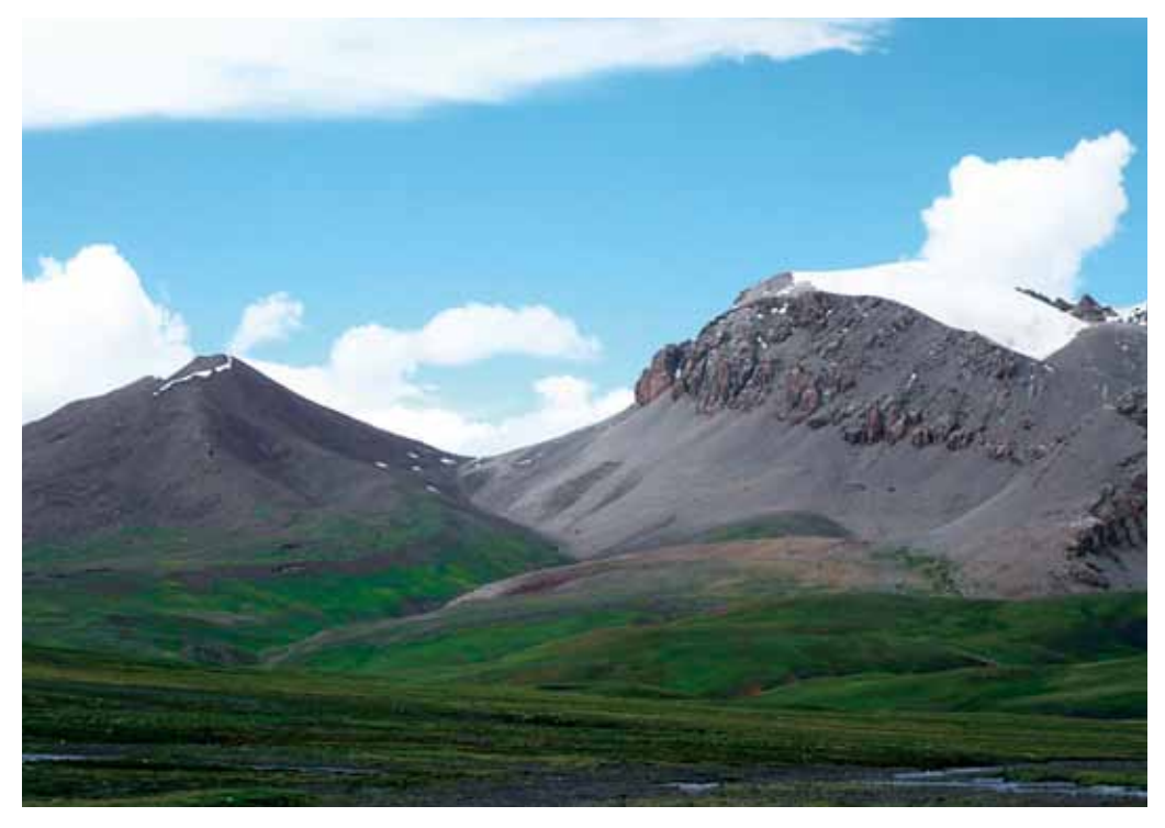
Fig. 5 View from the Gaoshanxigu valley. Jifu Mountain on the right, at the Mekong-Yangtze divide. The Mekong originates at the back of the mountain on the left, inside the Mekong basin.