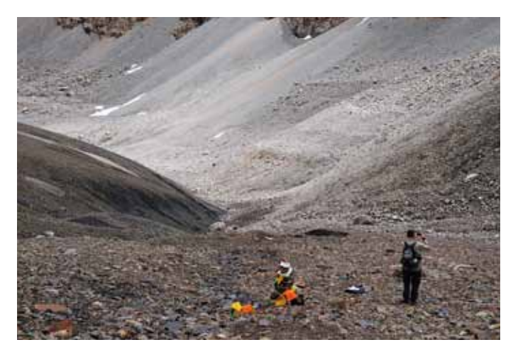
Fig. 3 Source of the lower stream. Photo in the direction of Jifu Mountain.