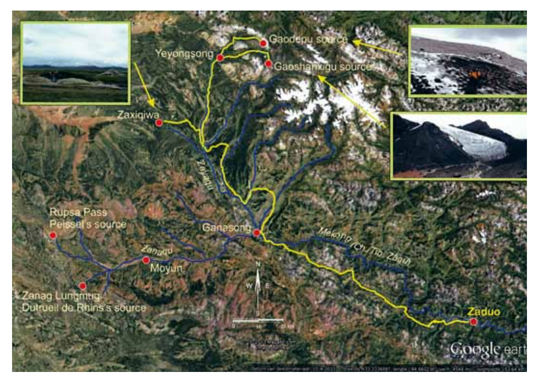
Fig. 1 Sources of the Mekong. Yellow line: gps-track of our route