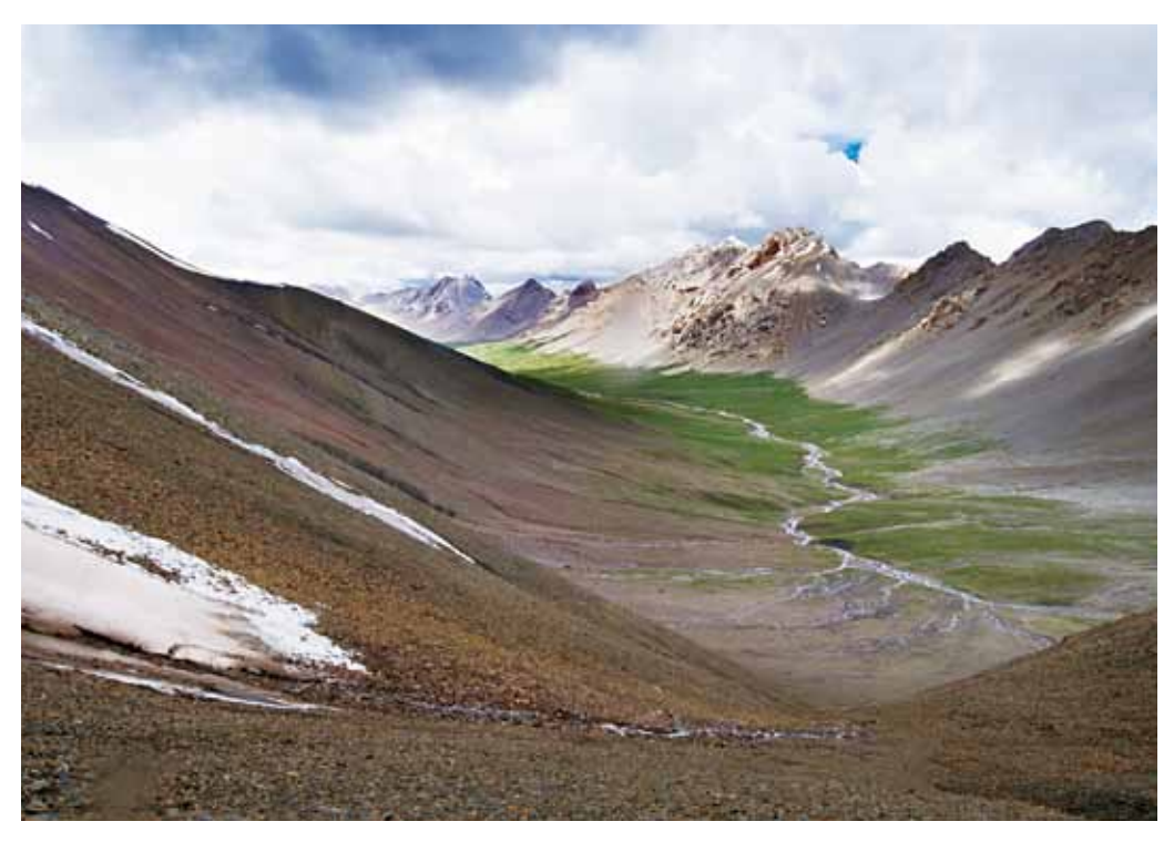
Stream from the new Mekong source flowing down to the first confluence.