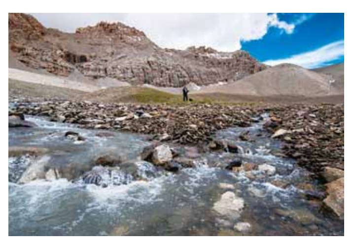
Fig. 2 The first confluence of the Mekong. The stream on the right flows from the Mekong source we discovered.