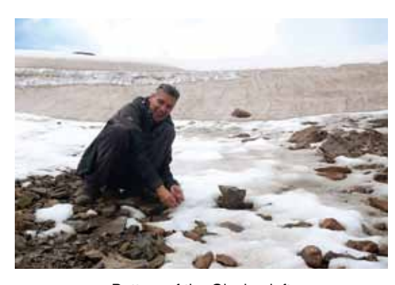
Bottom of the Glacier, left