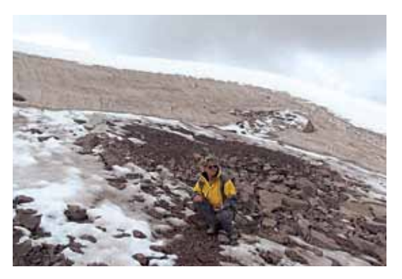
Bottom of the Glacier, right